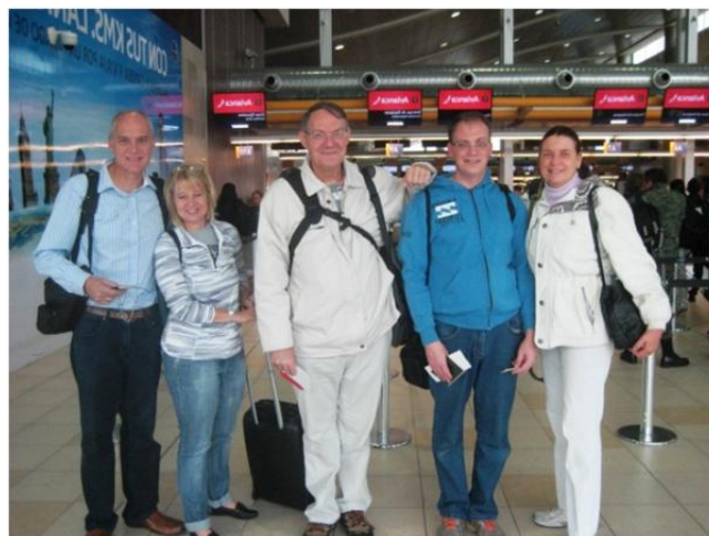
Leaving Quito for Cuenca