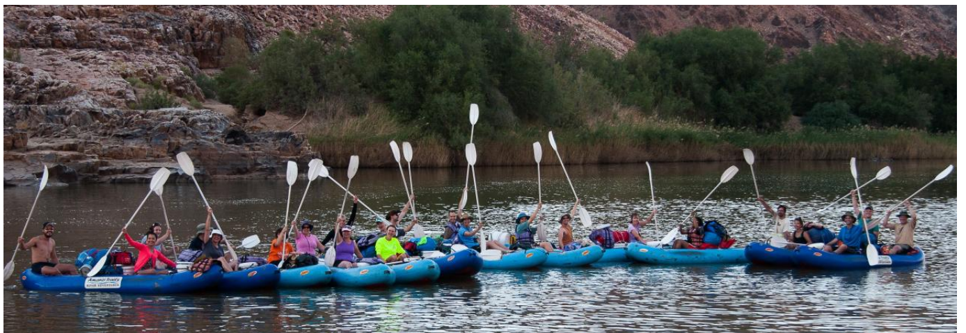
A group photo before the final morning of rowing gets underway