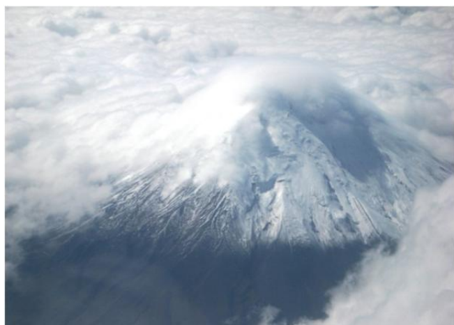
A snow-covered Cotopaxi – on the Equator!