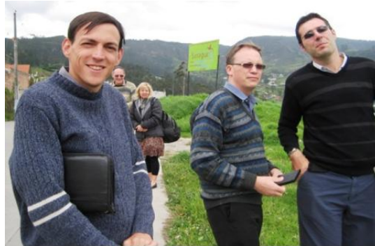
Walking in Saraguro