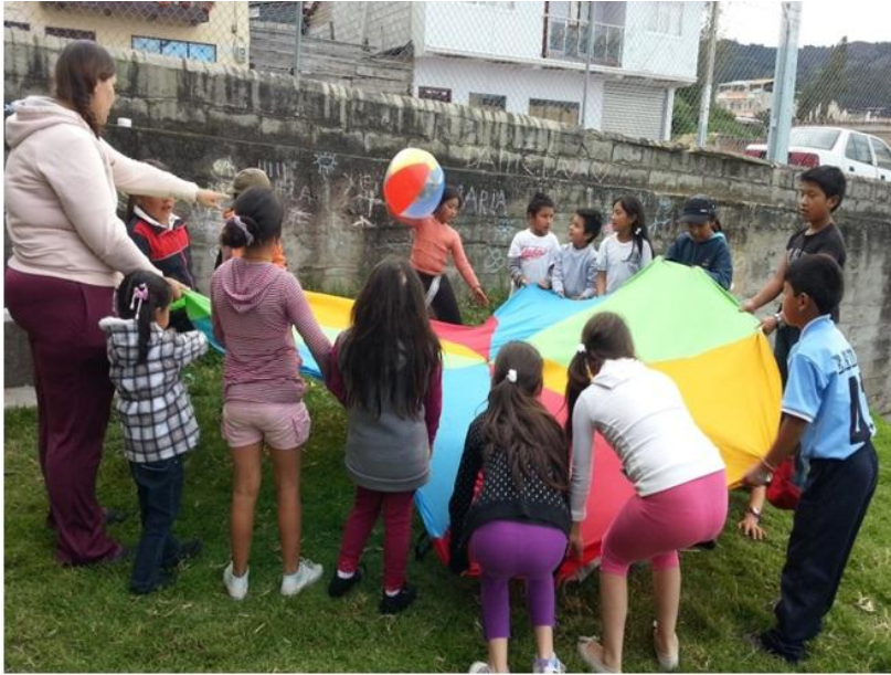
Children at the medical outreach