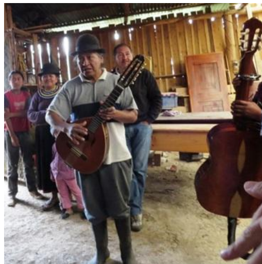
The pastor leads worship