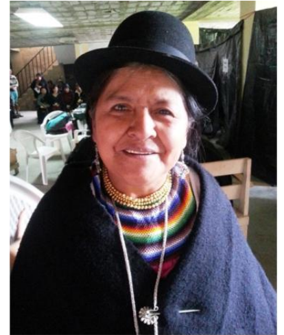
The pastor's wife in Tenta