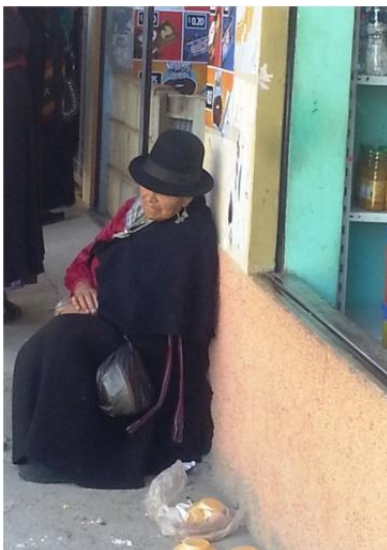
A woman waiting in the queue at Saraguro