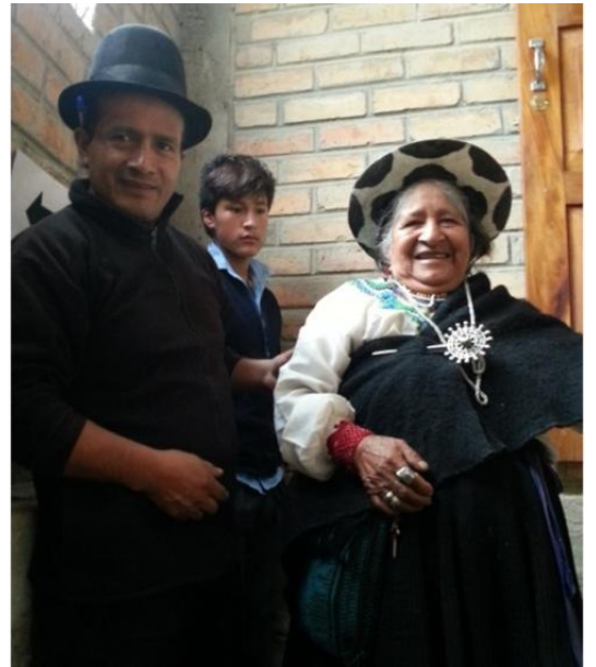
Medical outreach with the pastor and his mom