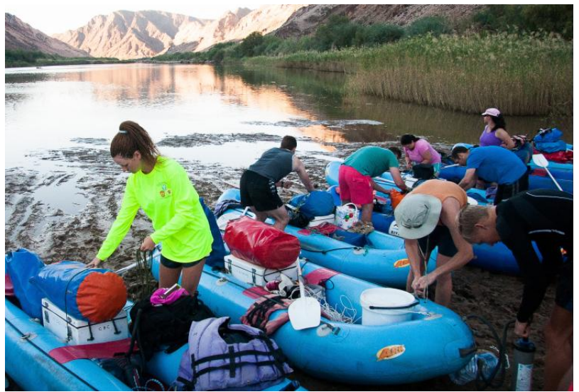
Packing the boats after a night under the stars