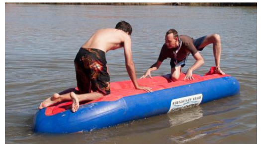
An inflatable boat can have more than one purpose!